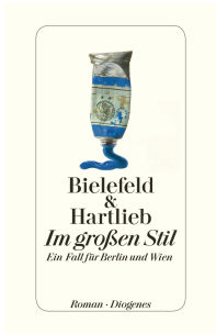
On a Grand Scale 416 pages 2015