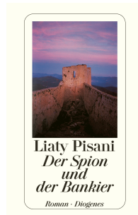
The Spy and the Banker 448 pages 1999