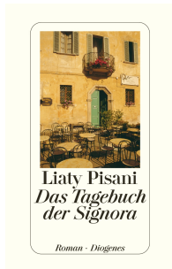
The Signora's Diary 288 pages 2007