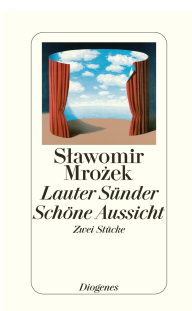
All Sinners and A Lovely View 208 pages 2002