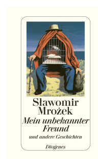
My Unknown Friend 192 pages 1999