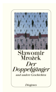
The Doppelgänger 272 pages 2000