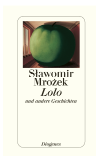
Lolo 304 pages 2000