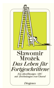
Life for the Advanced 240 pages 2006