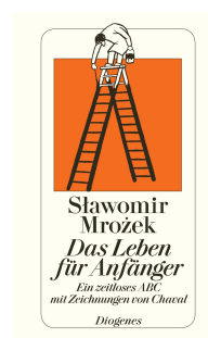
Life for Beginners 192 pages 2004