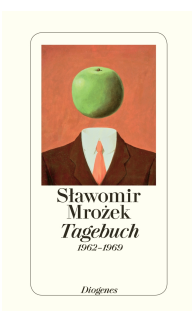
Journal 1962 - 1969 544 pages 2014

Slawomir Mrozek was born in Borzecin, Poland, in 1930. He was first known as a caricaturist and author of satirical short stories. His plays ( Tango , The Emigrants , Striptease , and many others) made him world famous. In 1968 he went into exile. After living many years in Paris and later in Mexico, he returned to Poland in 1996 and spent the final years of his life in southern France. He died on August 15, 2013 in Nice.