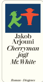
Cherryman Hunts Mister White 176 pages 2011