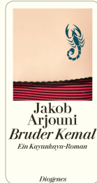
Brother Kemal 240 pages 2012