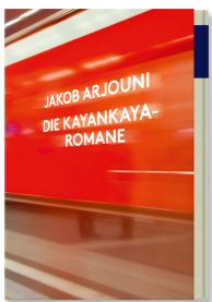
The Kayankaya Novels 1080 pages 2014

Jakob Arjouni, born 1964 in Frankfurt on the Main, has published novels, short stories, theatre and radio plays. Arjouni was only twenty-one years old when his acclaimed debut, ›Happy birthday, Turk!‹ was published and its main character, the Frankfurt-based private detective Kemal Kayankaya, took on his very first investigation. In 1991, the book was made into a film, directed by Doris Dörrie. Three further cases followed; for the third, ›One Man, One Murder‹, Jakob Arjouni was awarded the 1992 ›German Crime Fiction Prize‹. In autumn 2012, ›Brother Kemal‹, the fifth volume starring the German-Turkish investigator was published. The series is now firmly established as a classic amongst crime literature. Apart from his stage plays, his work also includes the Berlin novels ›Magic Hoffmann‹ (1996) and ›Holy Eddy‹ (2009) as well as ›Idiots. Five Fairy Tales‹ (2003). His novels ›Homework‹, ›Chez Max‹, and particularly his novel about an East-German Nazi follower, ›Cherryman Hunts Mister White‹, are now on school reading lists. The theme of addressing violence in all its forms runs through Arjouni's work like a red thread. His readers loved him for his thrilling, sharp-tongued, linguistically unpretentious, witty and clever books. He died on the 17th of January 2013 in Berlin. Jakob Arjouni's works have been published in 24 languages.