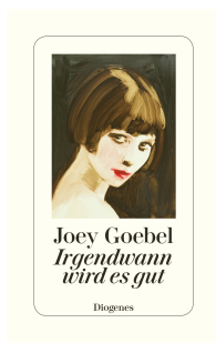
I Know It's Going to Happen for You Someday 320 pages 2019