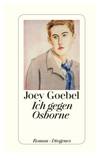
I Against Osbourne 432 pages 2013