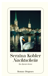
Bright Night 288 pages 2023 🏆 Award winner 📈 Bestseller