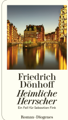
Secret Rulers 352 pages 2017