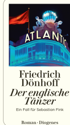
The English Dancer 304 pages 2010