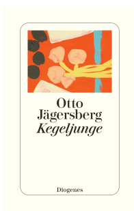
Pinboy 176 pages 2026