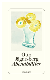
Evening Pages 176 pages 2024