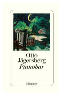
Piano Bar 272 pages 2021