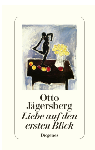
Love at First Sight 288 pages 2019