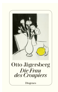
The Croupier's Wife 240 pages 2016