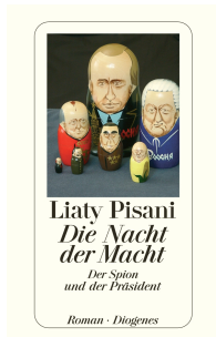
The Spy and the President 352 pages 2002