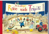
Travelling to Tripiti 48 pages 1967