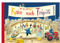
Travelling to Tripiti 48 pages 1967