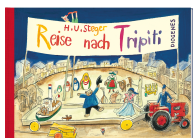
Travelling to Tripiti 52 pages 1967