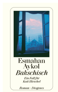
Baksheesh 336 pages 2004