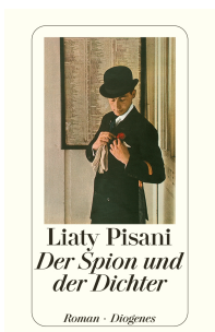
The Spy And the Poet 416 pages 1997