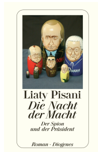
The Spy and the President 352 pages 2002