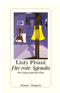
The Red Diary 416 pages 2012