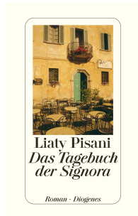
The Signora's Diary 288 pages 2007