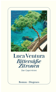
Bittersweet Lemons 320 pages 2021