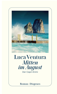
In the Middle of August 336 pages 2020