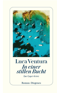
In a Hidden Cove 336 pages 2022