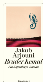
Brother Kemal 240 pages 2012