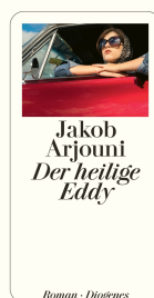
Holy Eddy 256 pages 2009