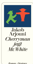
Cherryman Hunts Mister White 176 pages 2011