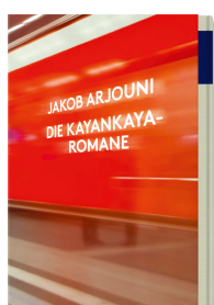
The Kayankaya Novels 1080 pages 2014

›A worthy grandson of Marlowe and Spade.« – Stern