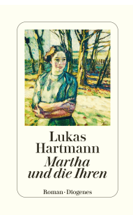
Martha and Her Kin 304 pages 2024 🏆 Bestseller

Lukas Hartmann, born in Berne in 1944, studied German and psychology. He was a teacher, journalist and media consultant. Today, he is a freelance writer living in Berne, writing books for adults and children. He is one of Switzerland's best-known authors and his novels regularly feature on the bestseller lists.