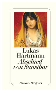
Goodbye to Zanzibar 336 pages 2013 🎬 Movie Adaptation 🏆 Bestseller