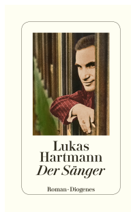
The Singer 288 pages 2019 🏆 Bestseller