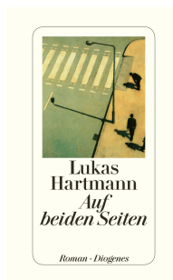
On Both Sides 336 pages 2015 🏆 Bestseller