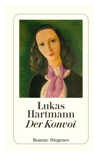
The Convoy 208 pages 2013