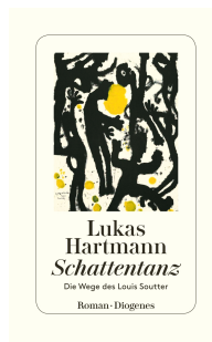
Shadow Dance 256 pages 2021 🏆 Bestseller