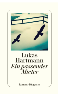
A Suitable Tenant 368 pages 2016 🏆 Bestseller