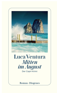
In the Middle of August 336 pages 2020