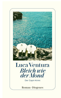
Pale as the Moon 304 pages 2023