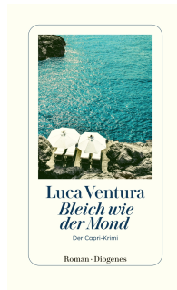
Pale as the Moon 304 pages 2023