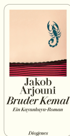
Brother Kemal 240 pages 2012