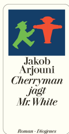
Cherryman Hunts Mister White 176 pages 2011