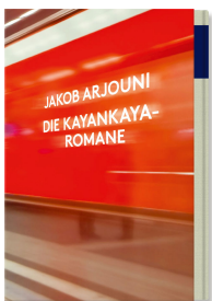
The Kayankaya Novels 1080 pages 2014

Jakob Arjouni, born 1964 in Frankfurt on the Main, has published novels, short stories, theatre and radio plays. Arjouni was only twenty-one years old when his acclaimed debut, ›Happy birthday, Turk!‹ was published and its main character, the Frankfurt-based private detective Kemal Kayankaya, took on his very first investigation. In 1991, the book was made into a film, directed by Doris Dörrie. Three further cases followed; for the third, ›One Man, One Murder‹, Jakob Arjouni was awarded the 1992 ›German Crime Fiction Prize‹. In autumn 2012, ›Brother Kemal‹, the fifth volume starring the German-Turkish investigator was published. The series is now firmly established as a classic amongst crime literature. Apart from his stage plays, his work also includes the Berlin novels ›Magic Hoffmann‹ (1996) and ›Holy Eddy‹ (2009) as well as ›Idiots. Five Fairy Tales‹ (2003). His novels ›Homework‹, ›Chez Max‹, and particularly his novel about an East-German Nazi follower, ›Cherryman Hunts Mister White‹, are now on school reading lists. The theme of addressing violence in all its forms runs through Arjouni's work like a red thread. His readers loved him for his thrilling, sharp-tongued, linguistically unpretentious, witty and clever books. He died on the 17th of January 2013 in Berlin. Jakob Arjouni's works have been published in 24 languages.