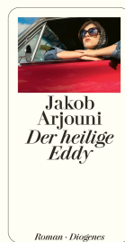
Holy Eddy 256 pages 2009