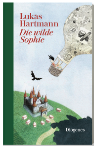
Wild Sophie 256 pages 2017