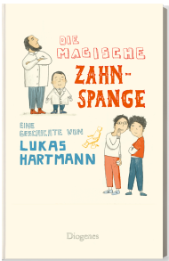
The Magic Braces 240 pages 2018

Lukas Hartmann, born in Berne in 1944, studied German and psychology. He was a teacher, journalist and media consultant. Today, he is a freelance writer living in Berne, writing books for adults and children. He is one of Switzerland's best-known authors and his novels regularly feature on the bestseller lists.