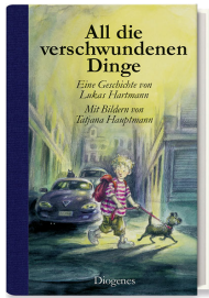
All the Missing Things 96 pages 2011