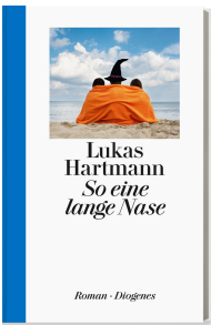
Such a Long Nose 208 pages 2010 🏆 Award winner