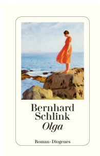
Olga 320 pages 2018 🏆 Bestseller