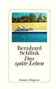
The Late Life 240 pages 2024 🏆 Bestseller