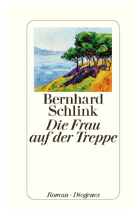
The Woman on the Stairs 256 pages 2014 🏆 Bestseller