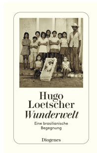
Was My Time My Time 192 pages 1983