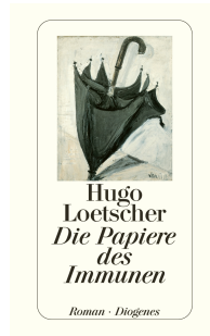
Papers of the Immune Man 512 pages 1986