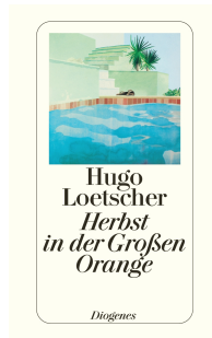
Autumn in the Big Orange 168 pages 1982