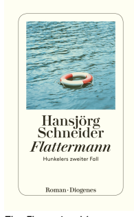
The Fluttering Man 160 pages 2011 🏆 Bestseller