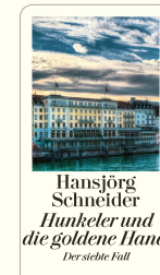
Hunkeler and the »Golden Hand« 240 pages 2013