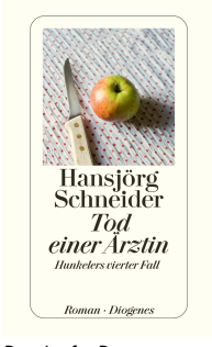
Death of a Doctor 240 pages 2011 📺 Movie Adaptation 🏆 Bestseller