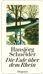
The Owl over the Rhine 288 pages 2021 Bestseller