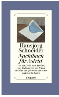
Night Book for Astrid 128 pages 2012