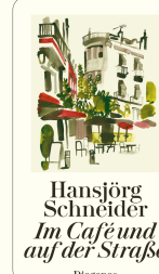
In the Café and on the Street 240 pages 2019