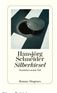
Silver Pebbles 240 pages 2011 📺 Movie Adaptation 🏆 Bestseller