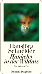
Hunkeler in the Wilderness 224 pages 2020 Bestseller