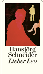
Dear Leo 304 pages 2016