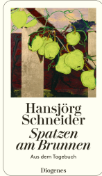
Sparrows at the Fountain 208 pages 2023 Bestseller