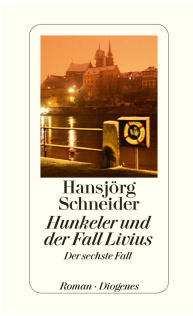
The Murder of Anton Livius 256 pages 2013 📺 Movie Adaptation 🏆 Bestseller