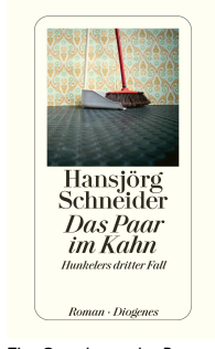
The Couple on the Barge 224 pages 2011 📺 Movie Adaptation 🏆 Bestseller