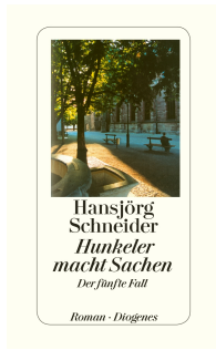
The Basel Killings 288 pages 2013 🏆 Award winner 📺 Movie Adaptation