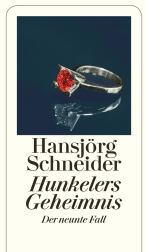
Hunkeler's Secret 208 pages 2015