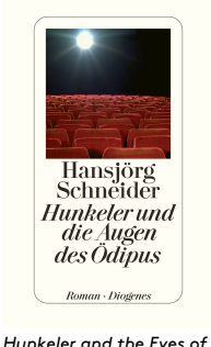
Hunkeler and the Eyes of Oedipus 240 pages 2010 📺 Movie Adaptation 🏆 Bestseller