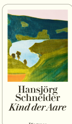
Child of the Aare 352 pages 2018 Bestseller