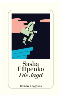
The Hunt 288 pages 2022