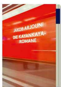
The Kayankaya Novels 1080 pages 2014

Jakob Arjouni, born 1964 in Frankfurt on the Main, has published novels, short stories, theatre and radio plays. Arjouni was only twenty-one years old when his acclaimed debut, ›Happy birthday, Turk!‹ was published and its main character, the Frankfurt-based private detective Kemal Kayankaya, took on his very first investigation. In 1991, the book was made into a film, directed by Doris Dörrie. Three further cases followed; for the third, ›One Man, One Murder‹, Jakob Arjouni was awarded the 1992 ›German Crime Fiction Prize‹. In autumn 2012, ›Brother Kemal‹, the fifth volume starring the German-Turkish investigator was published. The series is now firmly established as a classic amongst crime literature. Apart from his stage plays, his work also includes the Berlin novels ›Magic Hoffmann‹ (1996) and ›Holy Eddy‹ (2009) as well as ›Idiots. Five Fairy Tales‹ (2003). His novels ›Homework‹, ›Chez Max‹, and particularly his novel about an East-German Nazi follower, ›Cherryman Hunts Mister White‹, are now on school reading lists. The theme of addressing violence in all its forms runs through Arjouni's work like a red thread. His readers loved him for his thrilling, sharp-tongued, linguistically unpretentious, witty and clever books. He died on the 17th of January 2013 in Berlin. Jakob Arjouni's works have been published in 24 languages.