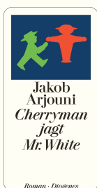
Cherryman Hunts Mister White 176 pages 2011