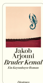
Brother Kemal 240 pages 2012