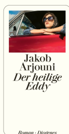
Holy Eddy 256 pages 2009