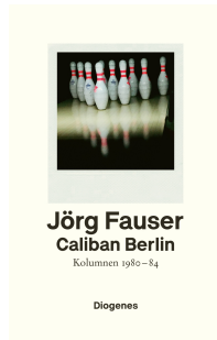
Jörg Fauser Caliban Berlin Kolumnen 1980–84 Diogenes