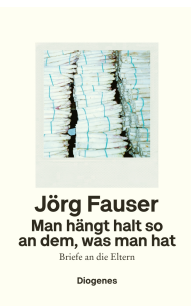
You Just Cling On to What You've Got 464 pages 2023