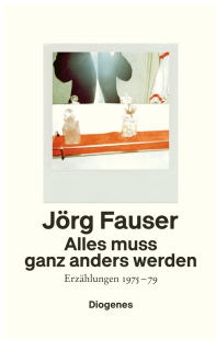
Jörg Fauser Alles muss ganz anders werden Erzählungen 1975–79 Diogenes

Everything Must Be Completely Different 288 pages 2020