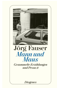
Jörg Fauser Mann und Maus Gesammelte Erzählungen und Prosa II Diogenes

The Beach in the Cities / Blues for Blondes 352 pages 2009