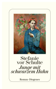
Boy with a Black Rooster 224 pages 2021 🏆 Award winner