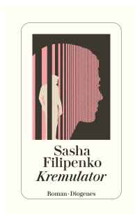
Kremulator 256 pages 2023 🏆 Award winner