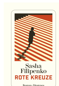
Red Crosses 288 pages 2020 🏆 Award winner 📈 Bestseller