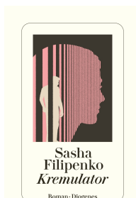
Kremulator 256 pages 2023 🏆 Award winner