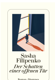
The Shadow of an Open Door 272 pages 2024 🏆 Award winner

Sasha Filipenko, born in Minsk in 1984, is a Belarusian author who writes in Russian. After leaving his training in classical music, he studied literature in St. Petersburg and worked as a journalist, scriptwriter, television presenter and gag writer for a satirical show. His novels Red Crosses and The Hunt were Spiegel bestsellers. Filipenko is an ardent football fan and lived in St. Petersburg until 2020. He had to leave Russia with his family and currently lives in Switzerland.