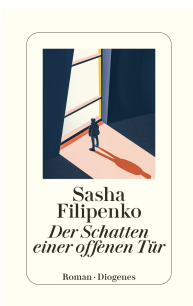
The Shadow of an Open Door 272 pages 2024 🏆 Award winner