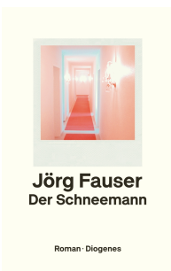
The Snowman 304 pages 2020