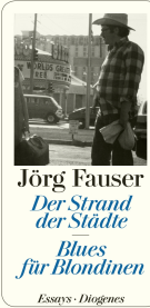
Jörg Fauser Der Strand der Städte Blues für Blondinen Essays · Diogenes

The Beach in the Cities / Blues for Blondes 352 pages 2009