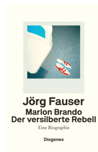
Marlon Brando 288 pages 2020