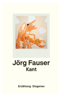
Kant 128 pages 2021