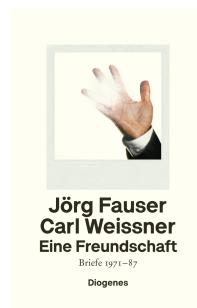
A Friendship 368 pages 2021