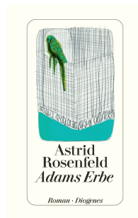
Adam's Legacy 400 pages 2011 🏆 Award winner 📌 Bestseller