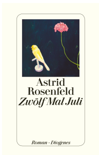
Twelve Times July 160 pages 2015