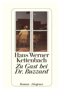
A Visit to Dr. Buzzard 368 pages 2006