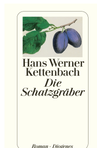
The Treasure-Hunters 544 pages 1998