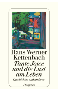
Aunt Joice and the Joy of Life 432 pages 2010