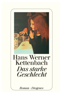
The Stronger Sex 448 pages 2009