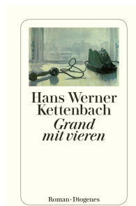
Grand With Four 240 pages 2000