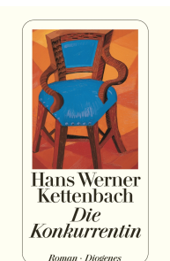
The Rival 528 pages 2002