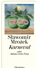
Carnival or The First Wife of Adam 80 pages 2014