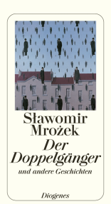
The Doppelgänger 272 pages 2000