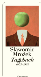
Journal 1962 - 1969 544 pages 2014

»Brilliant [...] the writer is an Aesop for our times.« – Publishers' Weekly, New York