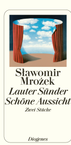
All Sinners and A Lovely View 208 pages 2002