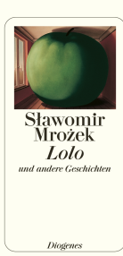
Lolo 304 pages 2000