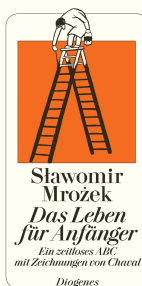
Life for Beginners 192 pages 2004