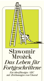
Life for the Advanced 240 pages 2006