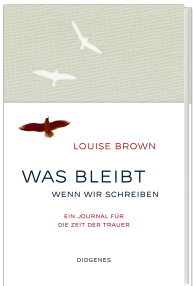
What Remains When We Write 240 pages 2023