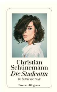
The Student 272 pages 2009