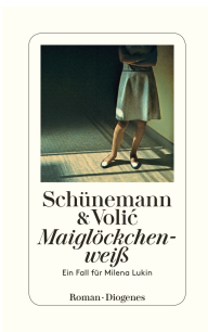
Lily-of-the-Valley White 352 pages 2017