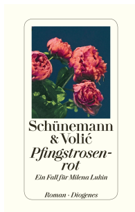
Peony Red 368 pages 2016