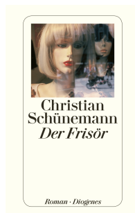
The Hairdresser 256 pages 2004 Award winner