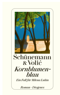
Cornflower Blue 368 pages 2013