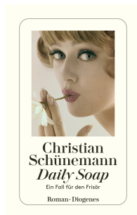
Daily Soap 240 pages 2011