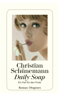
Daily Soap 240 pages 2011