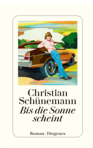
Until the Sun Shines 256 pages 2025