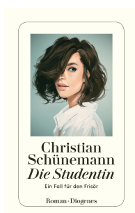
The Student 272 pages 2009