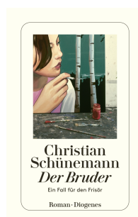
The Brother 288 pages 2008