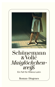
Lily-of-the-Valley White 352 pages 2017