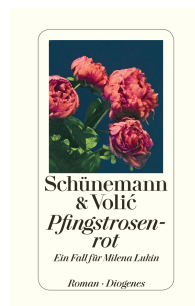
Peony Red 368 pages 2016