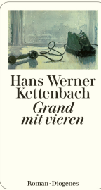
Grand With Four 240 pages 2000