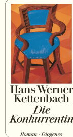
The Rival 528 pages 2002