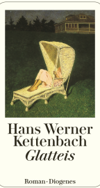
Black Ice 272 pages 2001