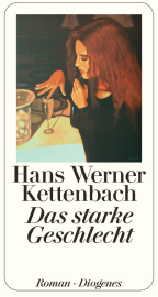
The Stronger Sex 448 pages 2009