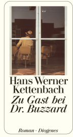
A Visit to Dr. Buzzard 368 pages 2006