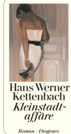
Small Town Affairs 512 pages 2004