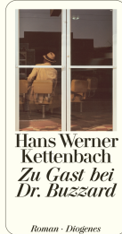
A Visit to Dr. Buzzard 368 pages 2006