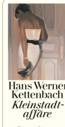
Small Town Affairs 512 pages 2004