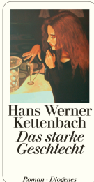
The Stronger Sex 448 pages 2009