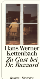
A Visit to Dr. Buzzard 368 pages 2006