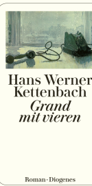
Grand With Four 240 pages 2000