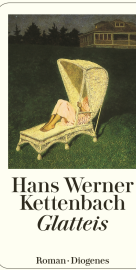
Black Ice 272 pages 2001