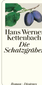
The Treasure-Hunters 544 pages 1998