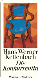
The Rival 528 pages 2002