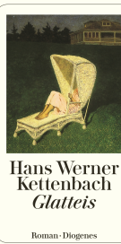
Black Ice 272 pages 2001