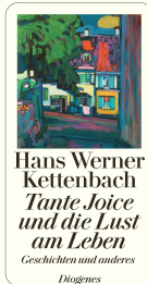
Aunt Joice and the Joy of Life 432 pages 2010

Hans Werner Kettenbach (1928 - 2018) studied many things over the years in four universities; he has worked as an advertising salesman, a shorthand secretary for the football magazine ›Kicker‹, a radio editor and finally as the editor of a newspaper. He wrote his first novel at the age of fifty. He has written a total of fourteen, five of which have been filmed. Critics have compared them to the works of Sjöwall/Wahlöö (›Plärrer‹), Simenon and Patricia Highsmith (›FAZ‹). In 2009 Kettenbach was awarded the ›Ehrenglauser‹ prize for crime writing for his life's work.