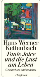
Aunt Joice and the Joy of Life 432 pages 2010

Hans Werner Kettenbach (1928 - 2018) studied many things over the years in four universities; he has worked as an advertising salesman, a shorthand secretary for the football magazine ›Kicker‹, a radio editor and finally as the editor of a newspaper. He wrote his first novel at the age of fifty. He has written a total of fourteen, five of which have been filmed. Critics have compared them to the works of Sjöwall/Wahlöö (›Plärrer‹), Simenon and Patricia Highsmith (›FAZ‹). In 2009 Kettenbach was awarded the ›Ehrengläuser‹ prize for crime writing for his life's work.