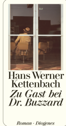
A Visit to Dr. Buzzard 368 pages 2006