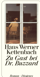
A Visit to Dr. Buzzard 368 pages 2006