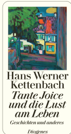
Aunt Joice and the Joy of Life 432 pages 2010