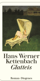
Black Ice 272 pages 2001