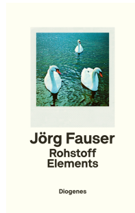
Jörg Fauser Rohstoff Elements Diogenes