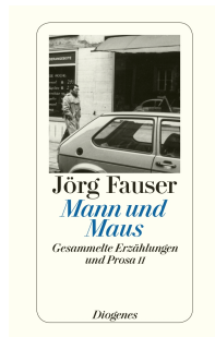
Jörg Fauser Mann und Maus Gesammelte Erzählungen und Prosa II Diogenes