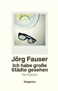
Jörg Fauser Ich habe große Städte gesehen Die Gelichte Diogenes