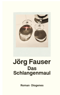
Jörg Fauser Das Schlangenmaul Roman · Diogenes