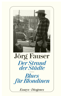
Jörg Fauser Der Strand der Städte / Blues für Blondinen Essays · Diogenes