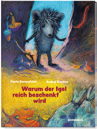
Hedgehog and the Present Puzzle 36 pages, 20.5 x 28 x 0.8 cm 2022