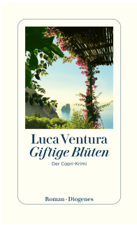
Poisonous Blossoms 368 pages 2026