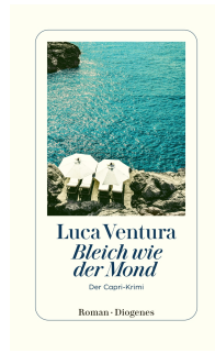
Pale as the Moon 304 pages 2023 Bestseller