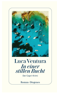
In a Hidden Cove 336 pages 2022 Bestseller