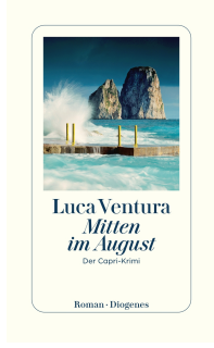
In the Middle of August 336 pages 2020 Bestseller