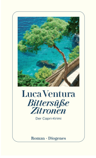
Bittersweet Lemons 320 pages 2021 Bestseller