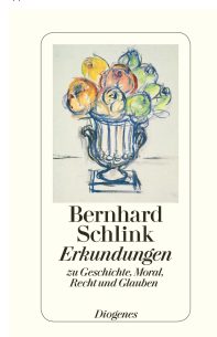
Explorations 288 pages 2015