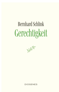
Justice 208 pages 2026

›The truly masterly aspect of Schlink's prose is its intelligence – an intelligence that is firmly rooted in common sense.« – Welt am Sonntag, Hamburg