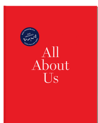
All About Us 144 pages 2017