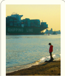
Sea Breeze 368 pages 2013