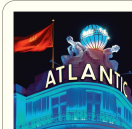
The English Dancer 304 pages 2010