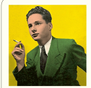
A Good Life Is the Best Revenge 192 pages 2014