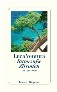
Bittersweet Lemons 320 pages 2021 🏆 Bestseller