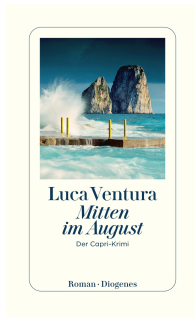
In the Middle of August 336 pages 2020 🏆 Bestseller