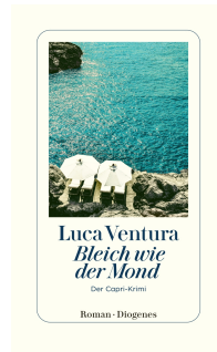
Pale as the Moon 304 pages 2023 🏆 Bestseller