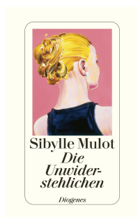
The Irresistibles 160 pages 2007