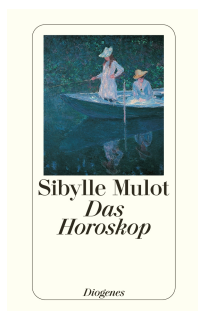
The Horoscope 128 pages 1997