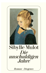
Innocent Years 240 pages 1999