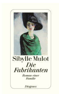
The Manufactures 400 pages 2005