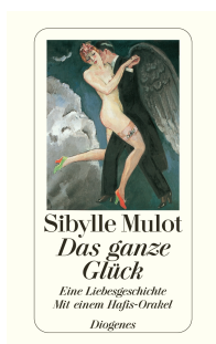
Perfect Happiness 176 pages 2001