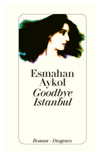
Goodbye Istanbul 368 pages 2007