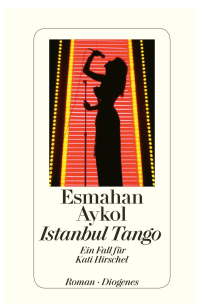
Istanbul Tango 336 pages 2016