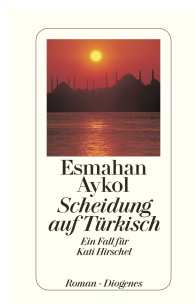
Divorce in Turkish 336 pages 2008