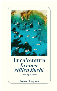
In a Hidden Cove 336 pages 2022

»A crime thriller where the blue of the sea blends with the darkest depths of human nature.« – Point de vue, Paris