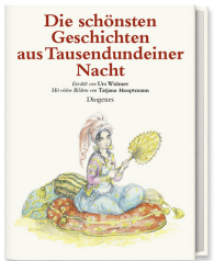
The Most Beautiful Tales From the Arabian Nights 144 pages, 22 x 27 cm 2008