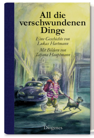
All the Missing Things 96 pages, 14.3 x 21.3 cm 2011