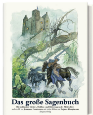
The Great Book of Legends 240 pages, 22 x 27 cm 1997