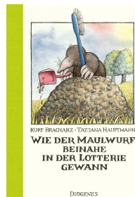
How the Mole Nearly Won the Lottery 64 pages, 15.5 x 19 cm 1981