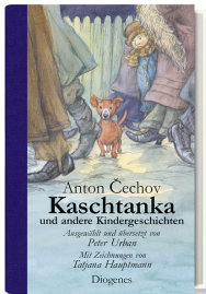
Kashtanka 160 pages, 14.3 x 21.3 cm 2004