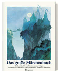
The Giant Book of Fairy Tales 672 pages, 22 x 27 cm 1987