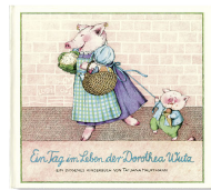
A Day in the Life of Petronella Pig 32 pages, 31.8 x 28.5 cm 1978