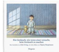
A Sound like Someone Trying Not to Make a Sound 40 pages, 27.5 x 25.2 cm 2005