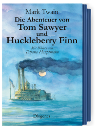
The Adventures of Tom Sawyer and Huckleberry Finn 816 pages, 14.3 x 21.3 cm 2002