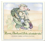
Hurry for Peregrine Pig 32 pages, 31.8 x 28.5 cm 1979