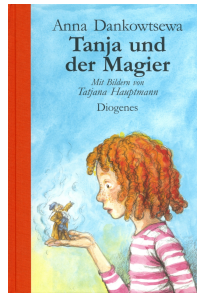
Tanja and the Magician 192 pages, 14.3 x 21.3 cm 2004