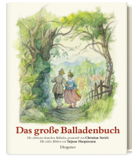
The Great Book of Ballads 152 pages, 22 x 27 cm 2009