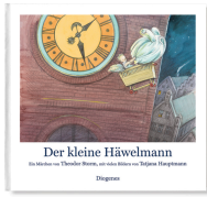
Little John 40 pages, 27.5 x 25.2 cm 2011