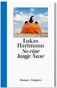
Such a Long Nose 208 pages, 11.6 x 18.4 cm 2010