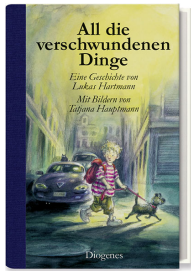
All the Missing Things 96 pages, 14.3 x 21.3 cm 2011