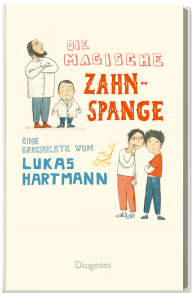
The Magic Braces 240 pages, 11.6 x 18.4 cm 2018

Lukas Hartmann, born in Berne in 1944, studied German and psychology. He was a teacher, journalist and media consultant. Today, he is a freelance writer living in Berne, writing books for adults and children. He is one of Switzerland's best-known authors and his novels regularly feature on the bestseller lists.