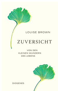
Joy 224 pages 2025